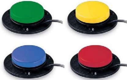
Spec/Jelly Bean Switch

Adaptive switches provide an interface for a user with limited physical ability to access a device screen or button; such as an iPad, speech generating device, or alert system. Switches may plug into a device or connect via bluetooth, and require minimal pressure or even just a slight movement to activate.