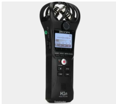
Zoom H1n Recorder

Used to record personal messages for communication, known as Message Banking.