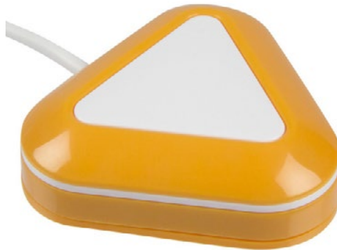
Candy Corn Switch

Highly sensitive touch-free switch that can be activated with just a wave.