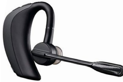
Plantronics Bluetooth Headset

Hands-free voice activated cell phone accessory.