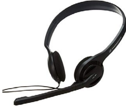
Sennheiser USB Microphone

Used to record necessary audio to create a personalized synthetic voice, known as Voice Banking.