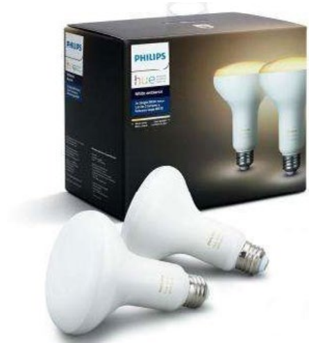
Smart Light Bulbs

LED bulbs that can be controlled with Apple or Androids apps.