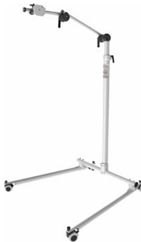
Tablet & SGD Floor Mount

Upright stand to hold tablet or speech generating devices.