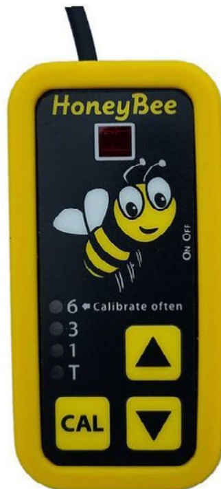
Honey Bee Switch

Switch can be activated touch-free at 3 and 6 inch distances.