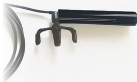
Switch Adapted Laser Pointer

Simple partner-assisted communication tool used by pointing or with laser pointer.