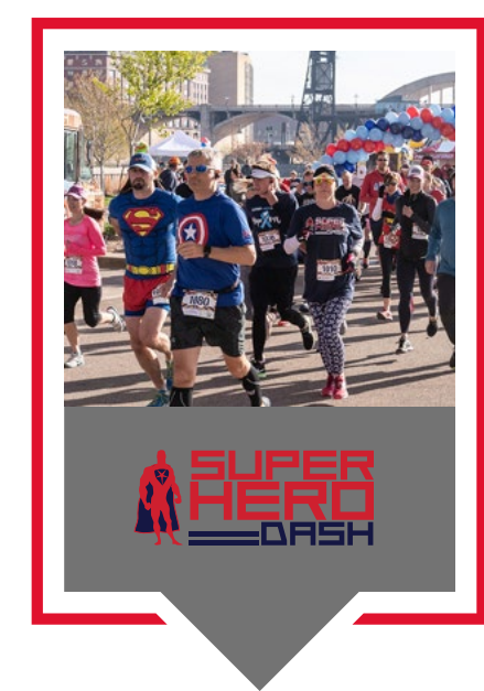
Last year's ALS SuperHero Dash saw more than 1,200 heroes at Raspberry Island in St. Paul raise an astonishing $206,000!