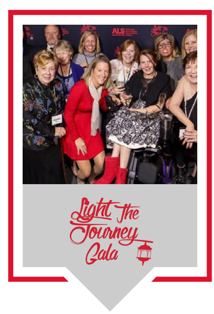
The 2019 Light the Journey Gala was a night to remember, raising more than $365,000 in the fight against ALS.