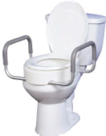
Raised Toilet Seat

A raised toilet seat can be used to assist a person who has limited leg strength. The raised height can vary and help the person when sitting and standing up. Some units come with handles.