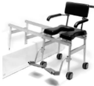
Tub Slide Shower System

Rolling chair attaches to a bridge that straddles tub wall and allows chair seat to slide across into tub. Chair can detach and be positioned over a toilet.