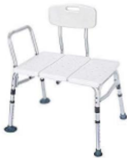
Tub Transfer Bench

Stationary chair with back that sits within the tub. Legs are height adjustable.