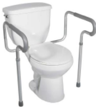
Toilet Safety Frame

A toilet safety frame is used to assist the person rising and lowering themselves on the toilet. The frame attaches to the toilet using the same hardware as the toilet seat. Frames feature padded armrests and are height adjustable.