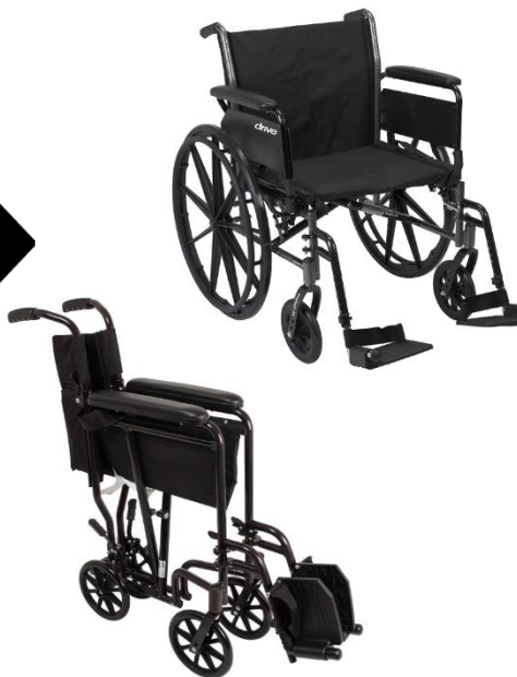
Manual Wheelchair/ Transport Chair

Manual wheelchair has small wheels in the front and large wheels in the back for self propelling; transport chair has small wheels in front and back and is propelled by an attendant. Armrests and footrests may be height adjustable and/or swing away to allow easy transfer to and from chair. Chair can fold up for easy transportation and storage.