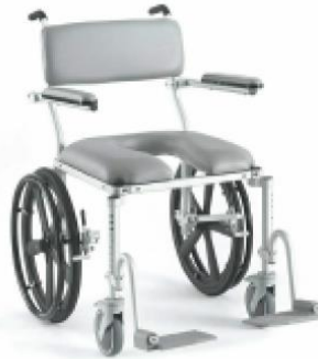
Rolling Shower Commode

Rolling chair for walk-in and/or accessible showers. It can also be positioned over a toilet, and may have a tilting feature.